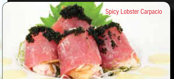
Spicy Lobster Carpaccio