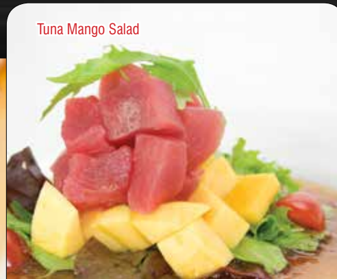
Tuna Mango Salad